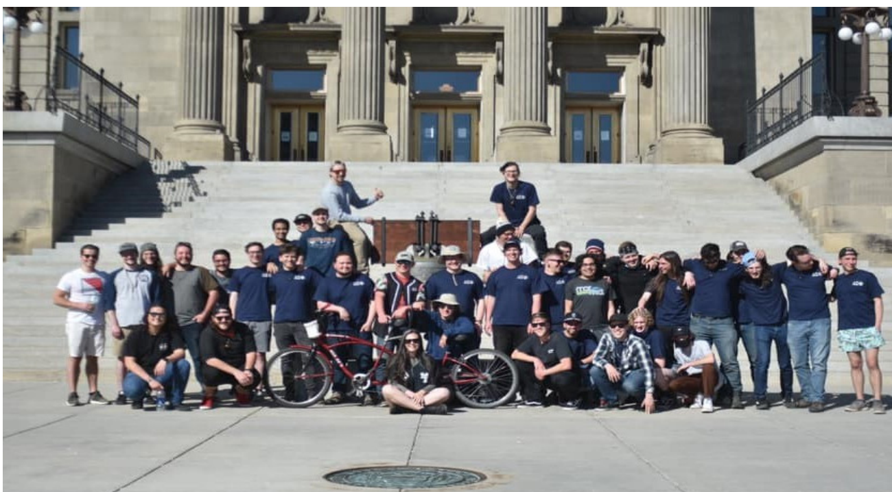
Borthers of Gamma Iota posing in front of the State Capital at the end of this year's Bike to Boise

8 Semesters In a Row With $0 Receivables. Well Done Undergrads!