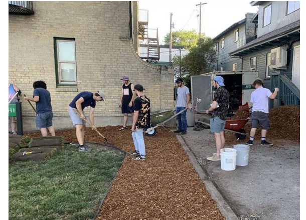
Work Week 2021