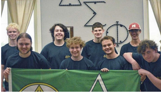
Pledge Class 2021

With the turn of the school year and renormalization of the Greek life experience following the peak of the Covid Pandemic last year, recruitment at the Gamma Iota Chapter of Delta Sigma Phi is looking up.