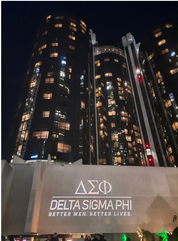
Westin Bonaventure Towers

It was the convention that almost wasn't. Originally scheduled for July, the dates had to be pushed out because of the COVID restrictions in place for Los Angeles. There was also concern if enough alumni and undergrads would register in time to even have the event despite being moved to October. Through promotion and alumni from several California chapters registering in big numbers, HQ was able to move forward with one of our best traditions on a national scale. Because of a conflict with midterms none of our undergraduates were able to attend. I would have loved to share that experience with them but I commend them for putting school first.