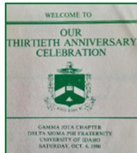
Page for the 30th anniversary event

The weekend concluded with the Vandals defeating Portland State 37-17. The game was a great send-off for this monumental achievement and a wonderful weekend of celebration. It also served as a prelude to the Mortgage Burning Celebration the following year in 1981.